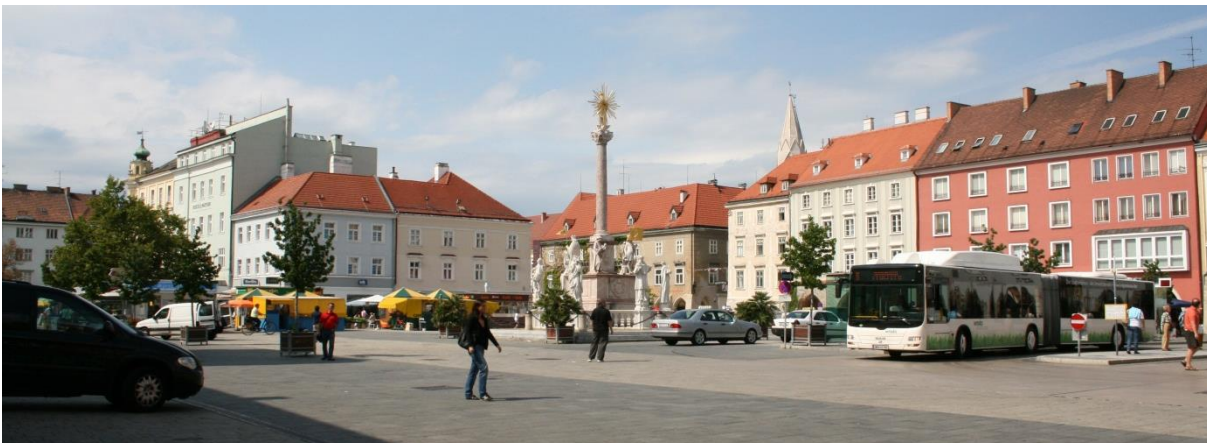
Hauptplatz (main square) with market