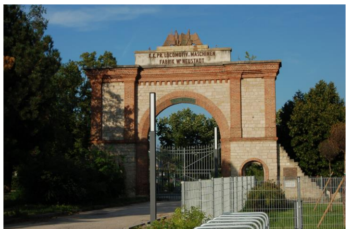
Gothic memorial (“Spinnerin am Kreuz”) in “Walther von der Vogelweide Park” and old industrial-architecture portal of the locomotive factory heavily struck by the tornado in 1916