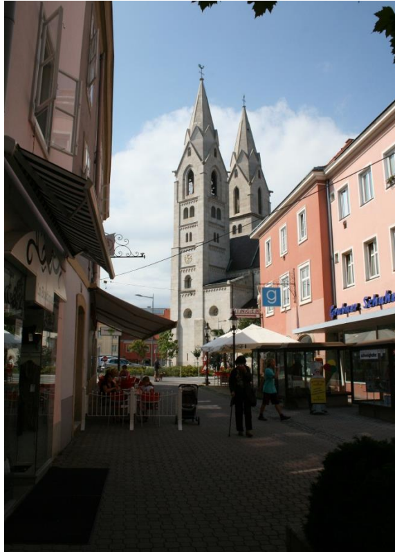
Hauptplatz at Herzog Leopold Straße with street cafes and Cathedral (“Dom”, in late Romanesque style) - view from Wiener Straße

During the “Tornado of 1916” tour you will visit the site of the former old locomotive factory, where the tornado caused the worst damage. The old portal is still visible as well as a memorial stone in the nearby cemetery. You will also pass by the famous gothic column “Spinnerin am Kreuz”.