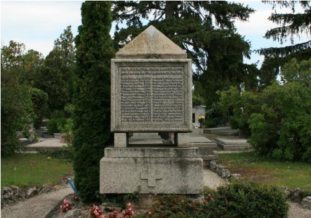
Tornado memorial (35 deaths in 1916) at the municipal cemetery