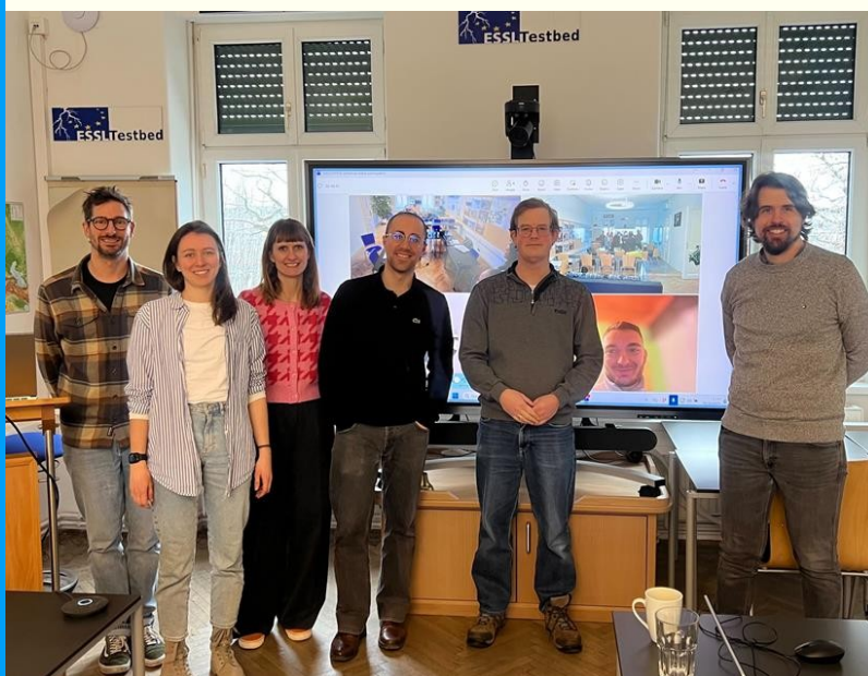
Participants of the kick-off workshop in Wiener Neustadt and online

In September 2025, ESSL started a collaboration with the Austrian Institute of Technology on modelling hail risk. Prompted by the surge in extreme and damaging hailstorms during recent years, these hazards have also recognized in regulations such as the EU Taxonomy for climate risks and the Corporate Sustainability Reporting Directive (CSRD). The HAILCHANGE project addresses this by combining high-resolution climate models (ICON, WRF) with ESSL's statistical approaches to improve hail probability forecasts . The outcome are detailed hail hazard maps for Austria and the Alpine region, covering both past events and future scenarios under different global warming levels. In March, the kick-off workshop of the project took place at ESSL in Wiener Neustadt.