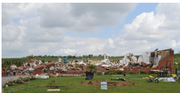
FIG. 1: total destruction of a solidly built house in Boussières-sur-Sambre (FR12 DOD10 ; EF-4).

Only 2 minutes later, the tornado reached an EF-2 intensity (many uprooted trees and several damaged houses), then, at 20.31 UTC, an EF-4 intensity, causing the total destruction of one solidly built house (FR12 DOD10, see Fig.1). Many trees were uprooted and some of them were completely debarked (TH DOD5).