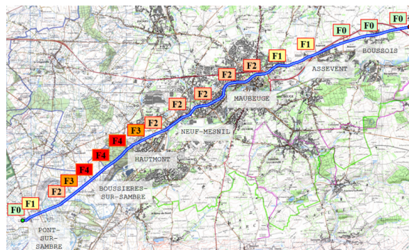
FIG. 2: the 19 km path of the "Hautmont tornado", from Pont-sur-Sambre (SW) to Bousois (NE) with EF-scale intensities and cities names.

The damage survey reveals that this tornado case is of greatest interest, because it hit a wide variety of terrains with a wide variety of intensities (see Fig.2), from corn fields and woods to highly populated areas, from a narrow EF-0 vortex to a 150 m wide severe EF-4 tornado.