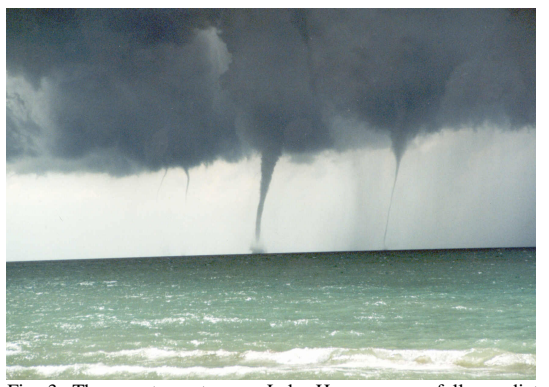
Fig. 3: Three watersouts over Lake Huron successfully predicted using The Szilagyi Waterspout Nomogram (September 9, 1999).

The waterspout nomogram has proven itself as valid prognostic tool and is continuously being refined with the addition of new data every year. Meteorologists in North America now routinely use the nomogram to forecast waterspouts up to 2 days in advance, as was the case over Lake Huron in September 9, 1999 (Fig. 3).