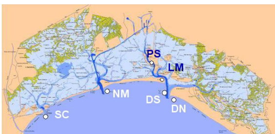
FIG.1: Overview of the Venice Lagoon with the three inlets: Chioggia (SC), Malamocco (NM), Lido Diga Nord (DN).

In the present work, we report preliminary results of VL-FEM and POM forecasts.